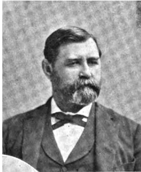
Peters's bill reducing postage for the blind languished for months in the House Committee on the Post Office and Post Roads, chaired by Eugene F. Loud (pictured above). Loud, a Republican, strongly opposed expanding postal services for Americans as long as the Post Office Department remained under the purview of the federal government, an arrangement he called "the most serious menace to our republican institutions."

Peters introduced his bill on December 8, 1897. It was referred to the Committee on the Post Office and Post Roads under the chairmanship of Representative Eugene F. Loud. This California Republican was a veteran of the Civil War. His service as a young man in the Union army included the Battle of Gettysburg and General Philip H. Sheridan's Shenandoah Valley campaign. Following the war, he spent fifteen years as a foreman in California's largest shoe factory. Loud's early political career included acting as cashier and tax collector of San Francisco, a position that may have fostered the actuarial preoccupation so evident during his time in Congress. He first won election to the House in 1890. Loud's political sympathies aligned him with his close friend William McKinley. He was an Old Guard Republican who staunchly supported big business and upheld gold during the decade's Battle of the Standards. 17