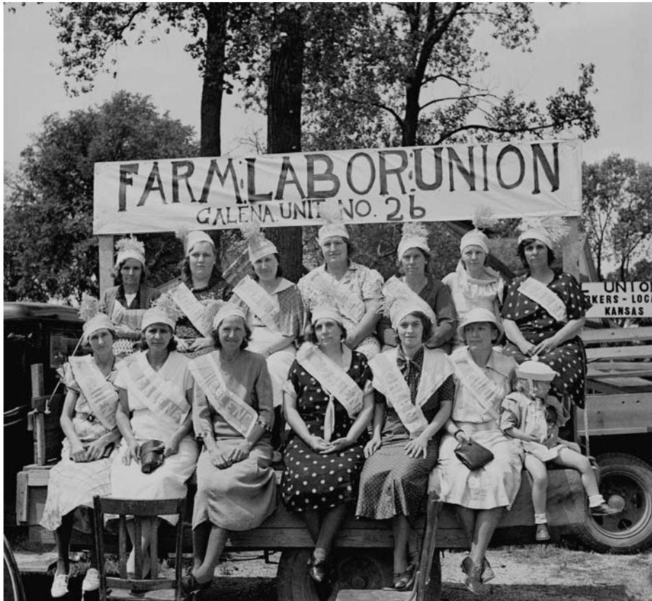
We know precious little about the history of the Farmers Union in Kansas from its arrival in the state in 1907 to its activities in the 1930s and 1940s. Photographs like this one, of women from Galena, Kansas, participating in a 1936 Union protest in nearby Columbus, witness the group's activities in the state, yet many unanswered questions remain. Some answers are perhaps tucked away in obscure local newspapers awaiting their first researchers on such topics.

kota, Minnesota, Montana, and Washington.