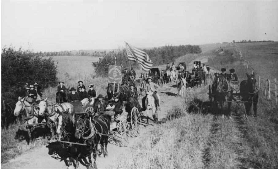
Populism is the single most important radical movement to emerge in Kansas and, as a result, has attracted the lion's share of scholarly attention. Pictured are citizens of Willowdale Township in Dickinson County on their way to a Populist rally, ca. 1890.