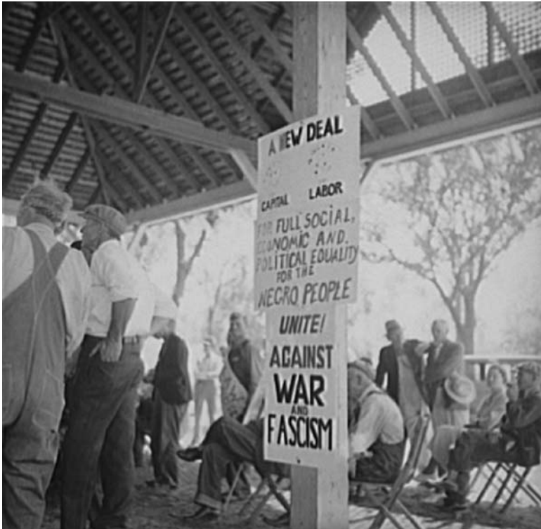
While there is a great deal more research to be done on relief worker organizations in Kansas during the 1930s, the Communist movement does not seem to have amounted to much at anytime in the state's history. Communist ideas were present even if the party in organized form was not, however, as can be seen in the slogans posted at this unemployment demonstration in Columbus, Kansas, in 1936: "A New Deal: For Full Social, Economic and Political Equality for the Negro People. Unite! Against War and Fascism."

From the mid-1920s into 1935, Kansas was part of the CP's District 10, a geographic unit that at times included Nebraska, Kansas, Iowa, Missouri, Arkansas, Oklahoma, Texas, and New Mexico. Despite its geographical area, this district had a relatively small membership throughout its existence, and a search of available CP records resulted in few specific references to activities in Kansas in these years. 41 I am reasonably certain that a close reading of the Daily Worker , as well as the press in particular locales, will provide additional information of Communist efforts in this state in the 1920s and 1930s, but outside of the relief worker movements and the Kansas City area, I suspect this research will confirm that Kansas was a backwater as far as Communism in this era was concerned. Later, in the Cold War period, Kansas had one of the smallest numbers of party members of any state in the country. In 1948, according to FBI figures that counted twenty-six thousand CP members in the United States, Kansas had only six party members. That tied Kansas with Wyoming, and only Mississippi had a smaller number. 42