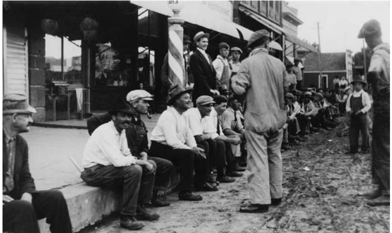
On a Sunday evening in 1916, harvest hands pass the time on a curb in Delphos, Kansas, before a week's work begins. This harvest season witnessed heavy campaigning by the Industrial Workers of the World (IWW, or Wobblies) throughout the Midwest. Research at the local level promises to provide a lot more information on the actions of this notorious group in Kansas.

The most unique American agrarian political movement in the twentieth century was the NPL. It emerged in North Dakota in 1915 and came to power the following year, electing the governor, attorney general, secretary of state, commission of agriculture, and a majority of the lower house of the legislature. Unlike the Populists, the NPL was not a separate political party, but instead was a well-disciplined organization that worked within the existing two party system. In North Dakota, the League took over the Republican Party in the primary and elected its candidates as Republicans in the fall. Ultimately, the NPL implemented its platform, including a state-owned bank, mill, and elevator. The NPL idea had a lot of appeal to many farmers in other states, and the League sent organizers to South Dakota, Montana, Idaho, Washington, Minnesota, South Dakota, Nebraska, Oklahoma, and Kansas. 33 Although it never had the same degree of success elsewhere, it did achieve some organizational success in parts of South Da-