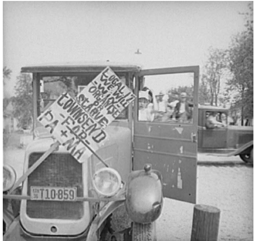
Some Kansans responded to the unemployment crisis caused by the Depression by protesting job conditions and cutbacks in New Deal relief projects. Above, a protest supporting the Townsend Plan, a precursor to the Social Security System, is put forth on the bumper of a truck in Columbus, Kansas, in 1936: "Local 17: We will Win // Organize or Starve // Townsend for Pa + Ma." Such protests sometimes resulted in a restoration of previous working conditions or even improved benefits through New Deal programs.

I do not know the extent of Communist involvement in the Kansas Workers Alliance, but Communists certainly played a significant role in the Workers Alliance nationally. While there is a great deal more research to be done on relief worker organizations in Kansas during the 1930s, I do not believe that the Communist movement amounted to much at anytime in the state's history. That said, two major Communist figures, Earl Browder and James Cannon, were native Kansans. Both Browder and Cannon were sons of socialists and were introduced to socialism early in their lives. Browder was from Wichita and Cannon from the Kansas City, Kansas, area. They became involved in radical journalism, and Browder was imprisoned during World War I for his opposition to the war. When the Communist movement emerged in the postwar period, both of them assumed active roles, with Cannon the more influential of the two for most of the first decade. By the early 1920s, both of them left Kansas for good. Browder became national secretary of the Communist Party (CP) in 1929; Cannon had been expelled from the party the previous year and assumed leadership of a newly formed Trotskyist movement. 40