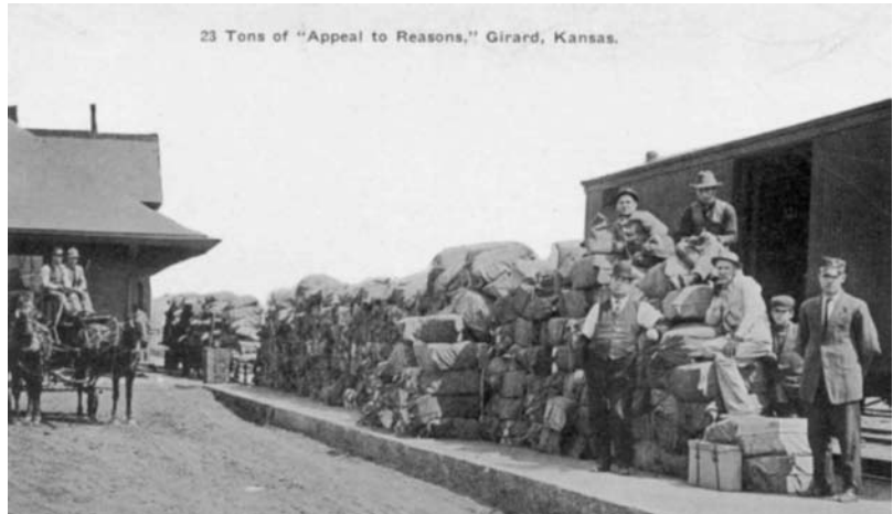
In Kansas the Socialist movement was made up of leftwing outposts rather than a statewide constituency. The state was home, however, to Julius Wayland and his weekly Socialist newspaper, the Appeal to Reason. The paper was published in Girard, where these men are pictured in 1913 with 23 tons of a special edition waiting to be loaded for delivery.

a leftwing Populist editor, who broke away from the party in 1896, in the wake of William Jennings Bryan's candidacy. He moved his paper to Girard in 1897 and began one of the most remarkable experiments in leftwing journalism in American history. The Appeal to Reason was designed to draw a wide readership across the country, and its articles avoided dogma and ideology, offering cartoons, muckraking exposes, human-interest stories designed to promote socialism, news of SP efforts across the country, and ongoing subscription contests. Upton Sinclair's The Jungle first appeared in its pages in serial form in 1905, and other prominent Socialist figures were contributors from time to time as well. The paper had a nationwide readership and claimed a circulation of more than 500,000 by 1910. At their peak special editions may have reached 750,000 copies. (Wayland's empire included a number of other publications as well, occupying two buildings and employing as many as thirty-five people.) The Appeal to Reason , although privately owned, was the Socialist Party's most important cultural institution and it (and the Appeal Army that hawked subscriptions in countless communities across the country) contributed to the electoral success that Socialists enjoyed prior to U.S. entry into World War I. 25