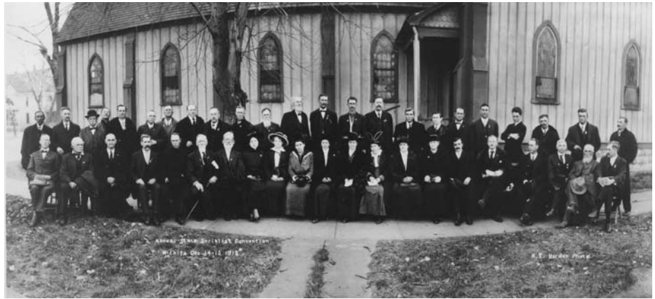
As demonstrated by this image of the Kansas State Socialist Convention held in Wichita on December 14–15, 1915, Socialists were active in the years leading up to and during World War I. The extent of the party’s political activity in the state in the years between 1900 and 1920, however, is a matter that demands more study.