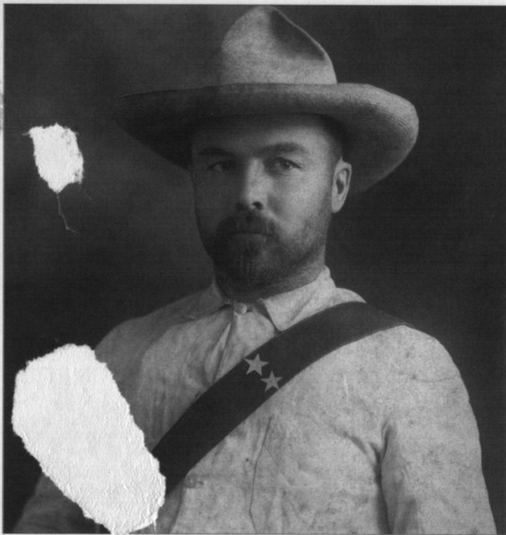
Frederick Funston, ca. 1897.

This year, 1998, marks the one hundredth anniversary of the "Splendid Little War," known officially in the United States as the Spanish-American War. The conflict, of course, was not so splendid for those 5,462 Americans who died from disease and battle wounds or for their more numerous counterparts among their Cuban allies or Spanish adversaries. Neither so for Filipinos who resisted American domination as they had Spanish or for those Americans who opposed U.S. imperialism. But the anniversary does afford the opportunity to explore some very real and significant Kansas connections with that international conflict, and no one was more identified with the conflict than Kansas's own Frederick Funston, pictured above in the uniform of the Cuban insurgent army.