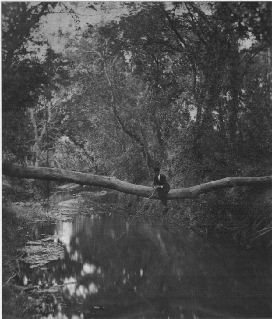
"Gems from the Walnut," Walnut Creek, Rush County

Kansas is not a state of great rivers or many navigable waterways, but riparian habitats have always been vital to the inhabitants of this prairie. Fish from the region's rivers and creeks, and more recently innumerable ponds and lakes, have supplemented the diets of "Kansas" families for centuries. In modern times fishing for sport or recreation, such as that depicted in this Rush County photograph, has been a popular diversion for many and a passion for others. Interestingly, while Kansans have not always been perfect stewards of their water resources, they have long been quite mindful of the types of species inhabiting their waters.