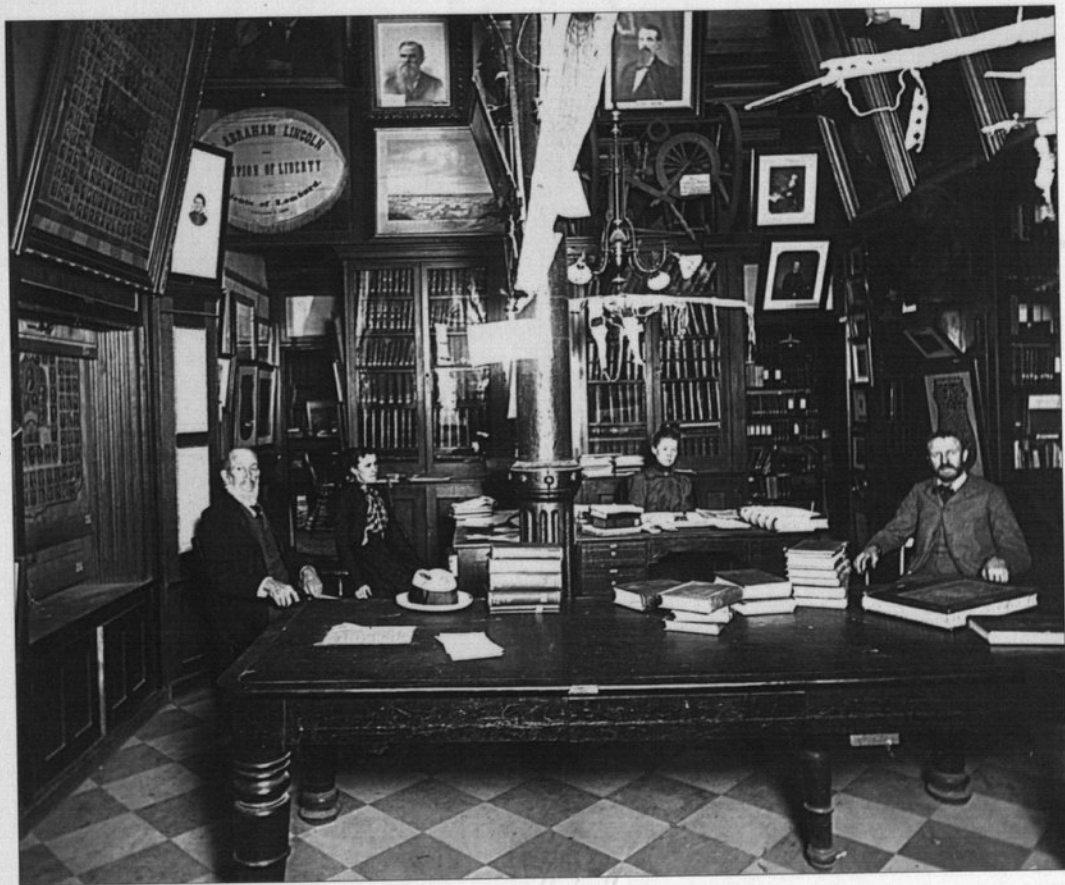
Kansas State Historical Society rooms, west wing of the statehouse, ca. 1895.

The Kansas State Historical Society has made its home on the corner of Tenth and Jackson Streets in Topeka for more than eighty years. For most of that time the GAR (Grand Army of the Republic) Memorial Building has housed all of the Society's historic documents, pre-historic and historic artifacts, and voluminous library collections, and entertained tens of thousands of serious researchers and curious visitors. The Society itself, however, is much older than its historic quarters. Its collections and tiny staff first resided in the state capitol.